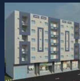
BALI SQUARE 7 BADAR COMMERCIAL DHA KARACHI