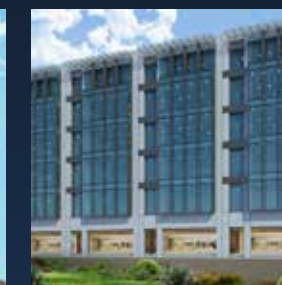
BALI HEIGHTS 2 MIDWAY COMMERCIAL B BAHRIA TOWN KARACHI