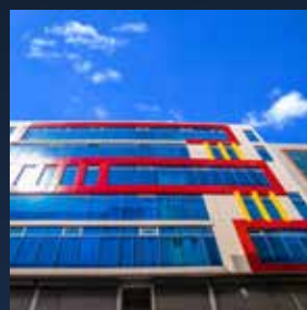
BALI SQUARE 5 BUKHARI COMMERCIAL DHA KARACHI